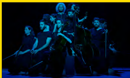
Symphony and Light with Israel's Revolution Orchestra takes us from Chopin to Radiohead in a show that combines orchestral music, stage movement, and video projections (June 26)