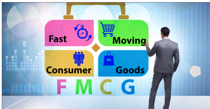
FMCG is one of the five key financing areas for fund managers

Romanian fundraising activity mainly relies on government agencies and international financial institutions today, but it's worth taking a look at the private equity field as well: even though there may be some negative aspects to it, there's also reason for optimism, as private equity will provide a lot of much-needed support to local entrepreneurs in the coming years.