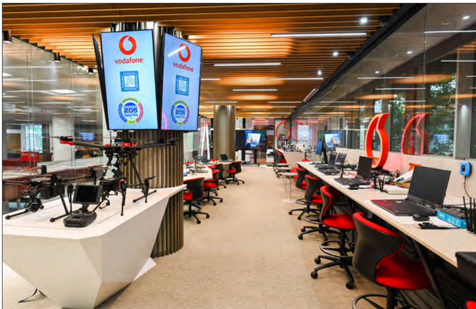
Vodafone Innovation Hub is equipped with the latest technologies in telecommunication