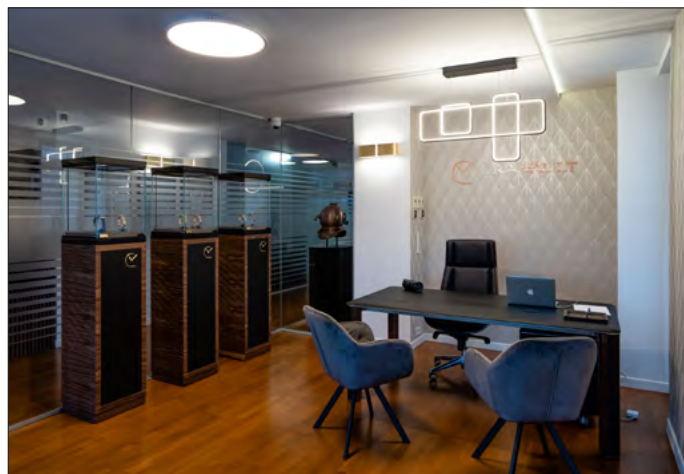
The global luxury goods market grew by 19-21 percent in 2022

EraVault, a luxury watch retailer, has announced the launch of the brand's first store in Romania, following an investment of over EUR 250,000. The store is located at 218 Calea Floreasca. The global luxury goods market grew by 19-21 percent in 2022 compared to the previous year, reaching EUR 1.38 trillion, according to the latest study by consul-