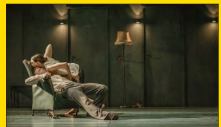
Diptych: Dreams from the Lost Chamber , a show by the Belgians from Peeping Tom brings contemporary dance to the stage in a manner never seen before. Reality, dream, fantasy (July 1 and 2)