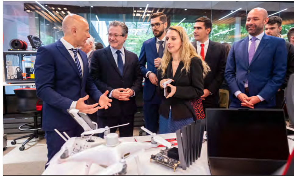
Opening Vodafone Innovation Hub at Politehnica University of Bucharest

"The Politehnica University of Bucharest is recognised as being one of the most important trainers of highly specialised engineers in the region, a position that makes our graduates highly sought after by large employers. It is a privileged position that would not have been possible without partners who are dedicated to education, research, and digitalization, such as Vodafone Romania. Through