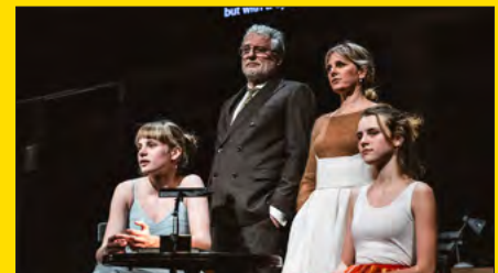
The Last Supper - Milo Rau / NTGent – an event show and experiment, a mix between real and virtual, between what is in front of one's eyes and what is hidden, but still visible (June 29 and 30)