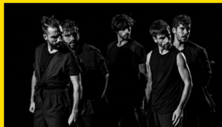
The Flamenco Miracle – EstévezPaños y Compañía – a show that brings the best flamenco dancers on stage, moving to rhythms that ignite the blood and the imagination. The Spanish Ministry of Culture awarded this troupe the National Dance Award (June 23 and 24)