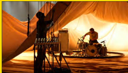
The Measure of the Impossible , a show written and directed by Tiago Rodrigues, current artistic director of the Avignon Festival (June 23 and 24)